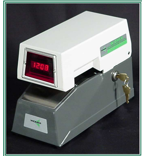
Mfg. Hackensack, NJ, USA Model T-LED-3 available without digital display

Six Sided Word Cylinder Military Time Reverse Print Fractional Minute Adjustable Trigger Removable Die Plates Master Clock Control Feather Touch Trigger