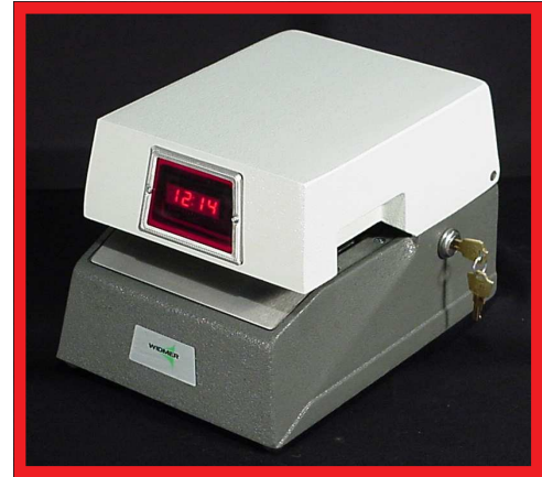
Model 776 available without Digital Display.

Dual Printing Heads Precise Timing Accurate Numbering Heavy Penetration Lasting Performance