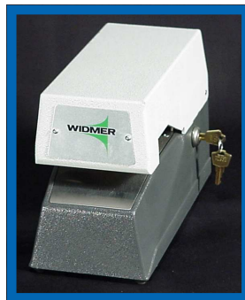
D-3 Date / Signature Stamp

The Two-step Emboss & Imprint Combines the E-3 Embosser and D-3 Date / Signature stamp. Documents can be processed with the Agency seal embossed and the official's Signature, title and date (and/or numbered) imprinted in indelible ink..