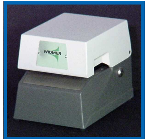
TV 776 Imprinter

Model TV-776 Electric Imprinter Will print the Agency seal , Official's signature , title and other appropriate text in tri-color or single color ink. Two printing heads enable numerous combinations of seal, signature, text, date and number. Options include security lock, guide shelf, LED time display, visual counter and others.